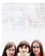
Thick & Tight.