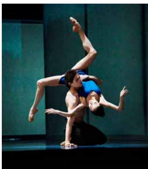
Christopher Wheeldon's Bound To*

S P FF W Part of Family Weekend. Age guidance: 4+