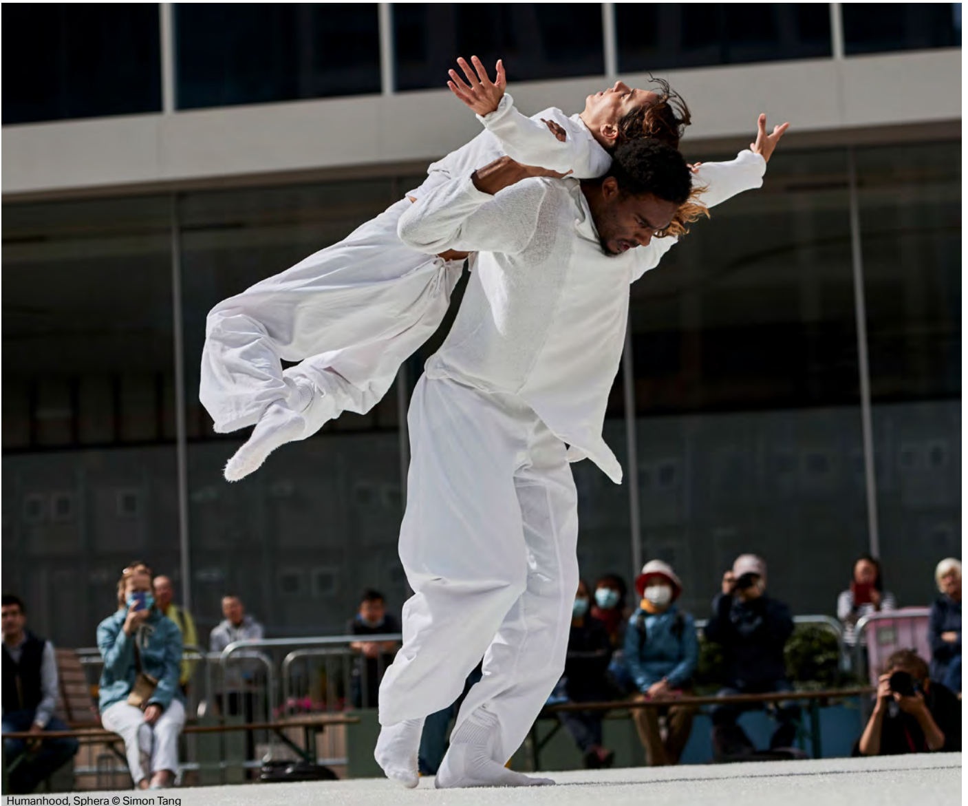
Humanhood, Sphera © Simon Tang

Supported by RocaUmbert. Funded by Arts Council England.