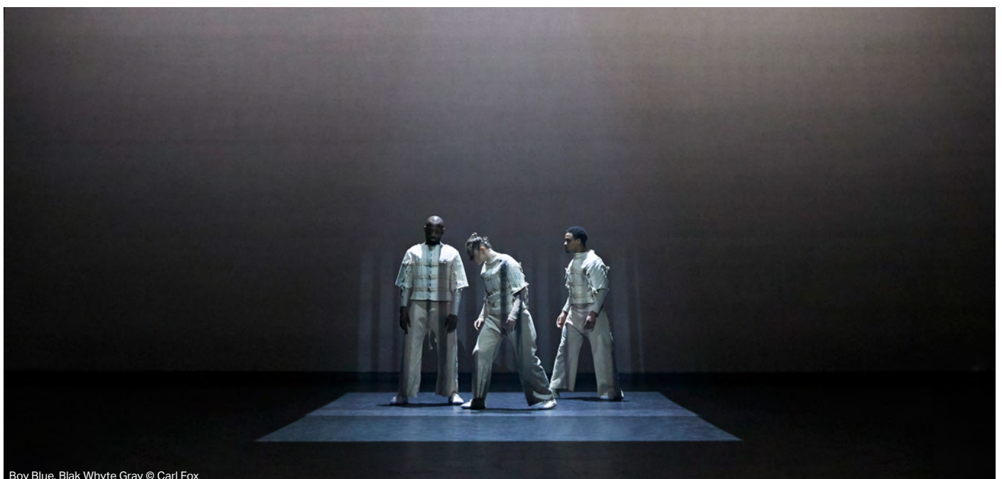
Boy Blue, Blak Whyte Gray

Produced by Boy Blue. Co-commissioned and co-produced by the Barbican. Supported using public funding by Arts Council England. Boy Blue is an Associate Artist of the Barbican, London.