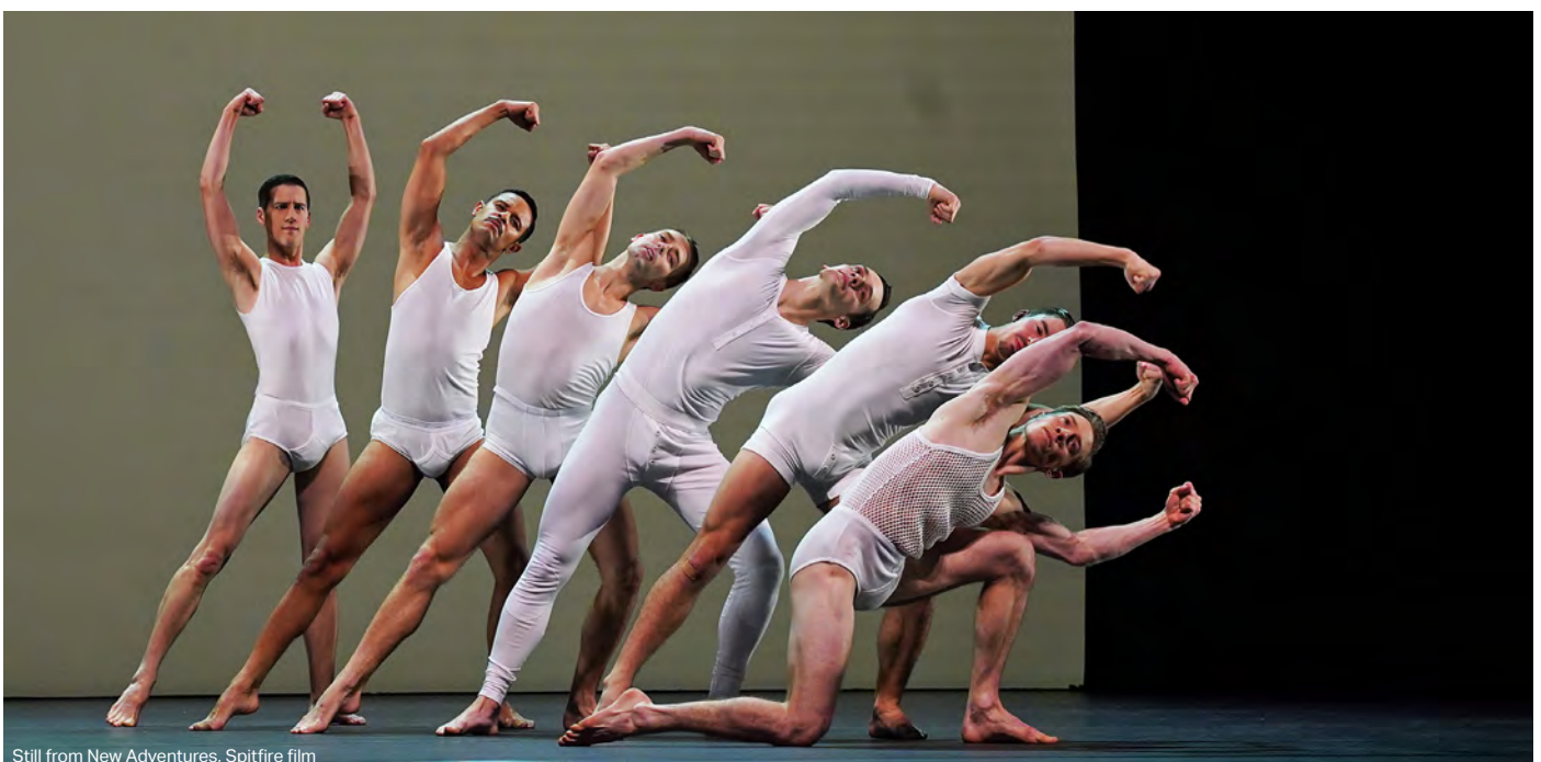
Still from New Adventures, Spitfire film