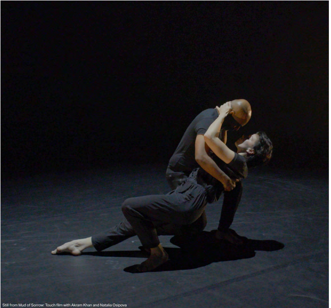
Still from Mud of Sorrow: Touch film with Akram Khan and Natalia Osipova