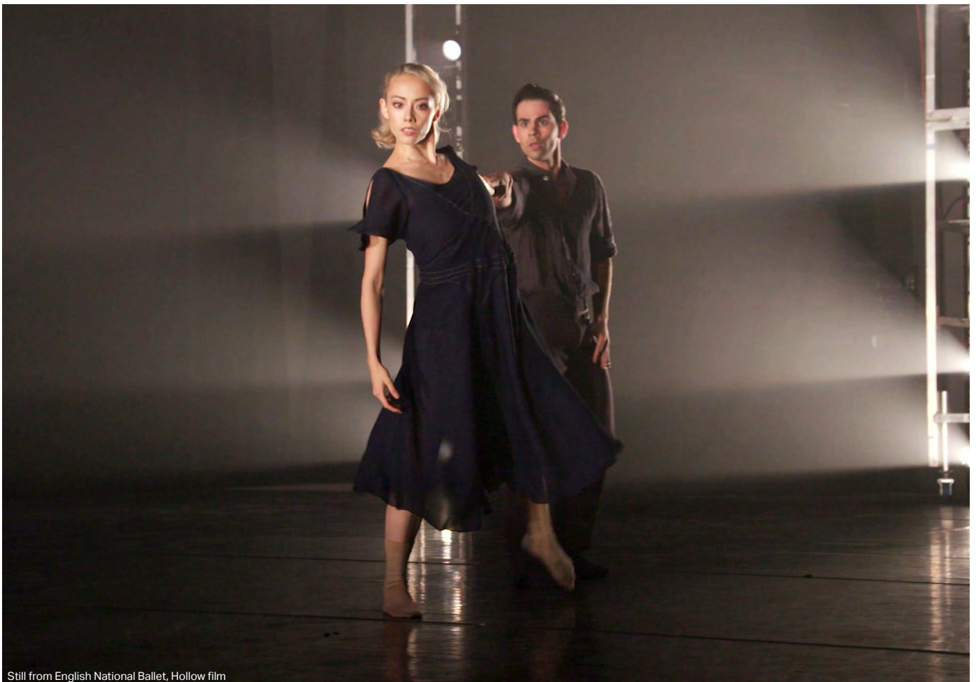
Still from English National Ballet, Hollow film