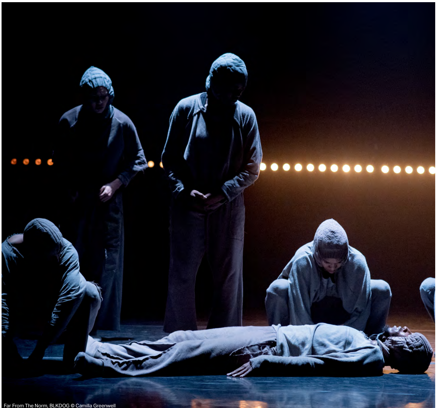
Far From The Norm, BLKDOG

BLKDOG is co-produced by Far From The Norm and Sadler's Wells and supported by Arts Council England.