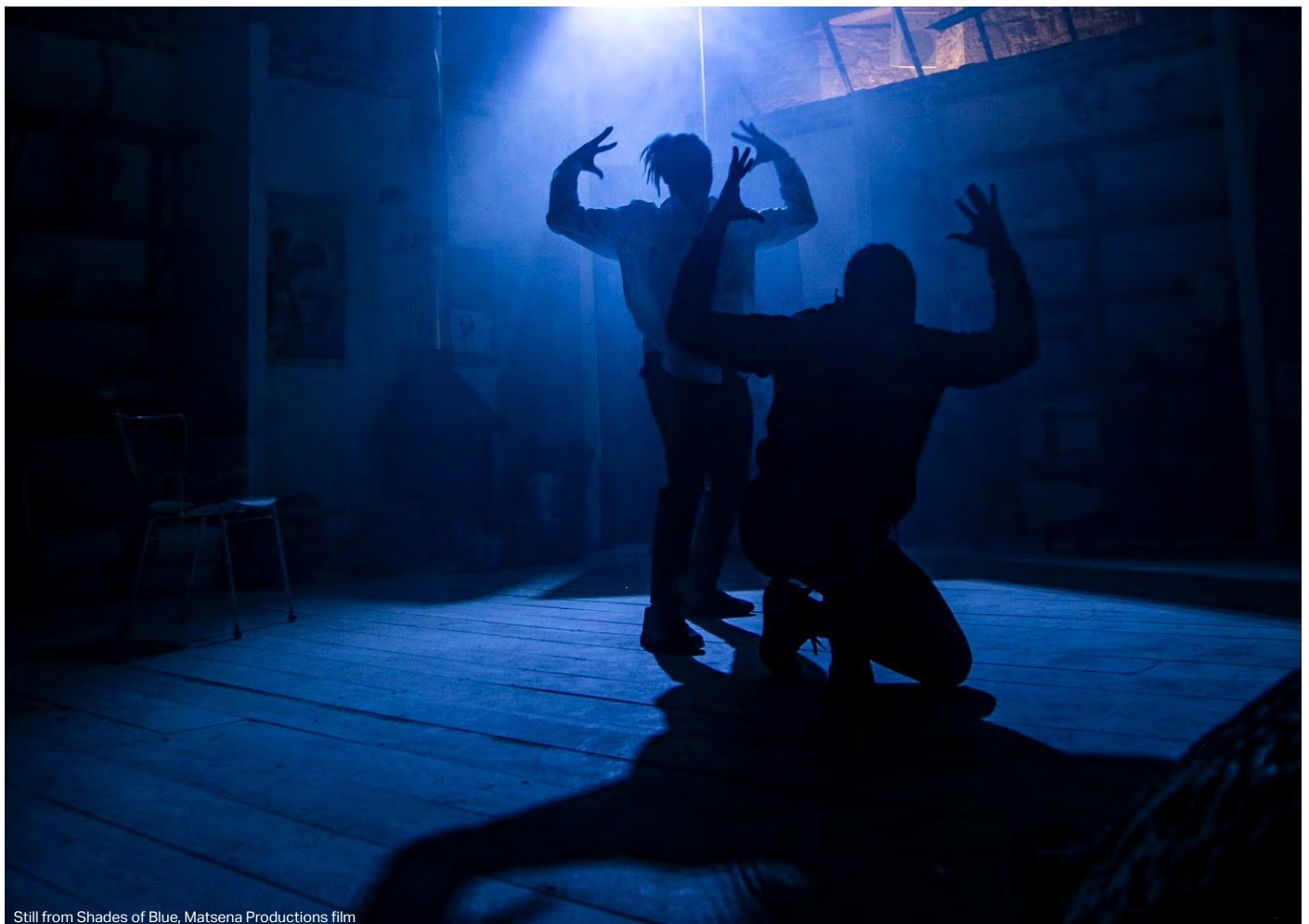
Still from Shades of Blue, Matsena Productions film

With thanks to Riverside Studios and Messums Wiltshire.