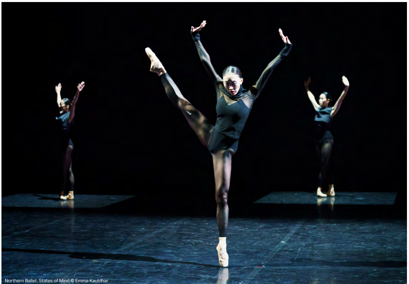
Northern Ballet, States of Mind

Presto [Sonata for Violin Solo No. 1 in G Minor, BWV 1001] , performed by Hilary Hahn, composed by Johann Sebastian Bach, courtesy of Decca Classics, under license from Universal Music Operations Ltd.