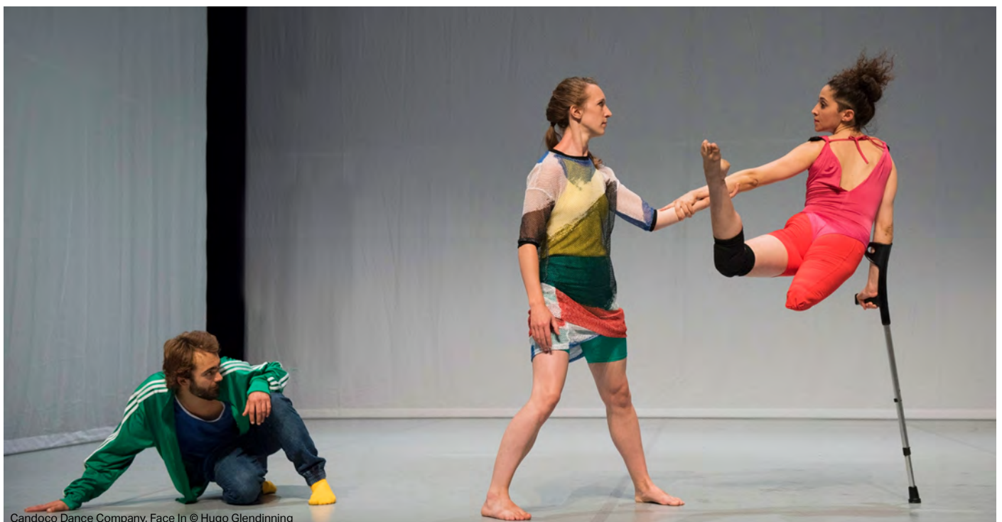
Candoco Dance Company, Face In

This piece is co-commissioned by: Festival Oriente Occidente and Trinity Laban Conservatoire of Music and Dance.